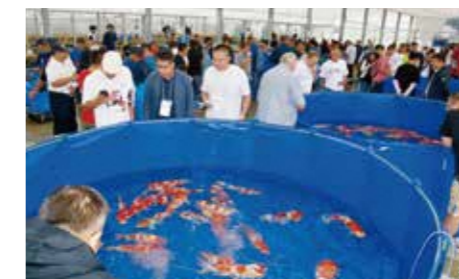
Nishikigoi aficionados from abroad gathering in the mountainous area of Niigata

In exhibitions, Nishikigoi are valued according to their shape, patterns and the vividness of colors. The exhibition with the richest history takes place in Niigata, attracting a multitude of aficionados and buyers from home and abroad. At present these exhibitions are held around the world as well.