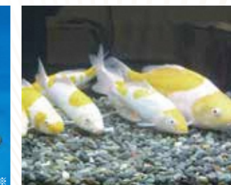
KIJIRO (2014, a new breed born in Niigata)